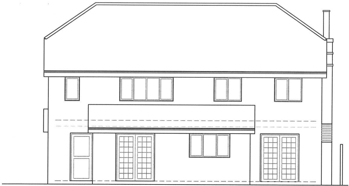
EXISTING REAR ELEVATION 'C'