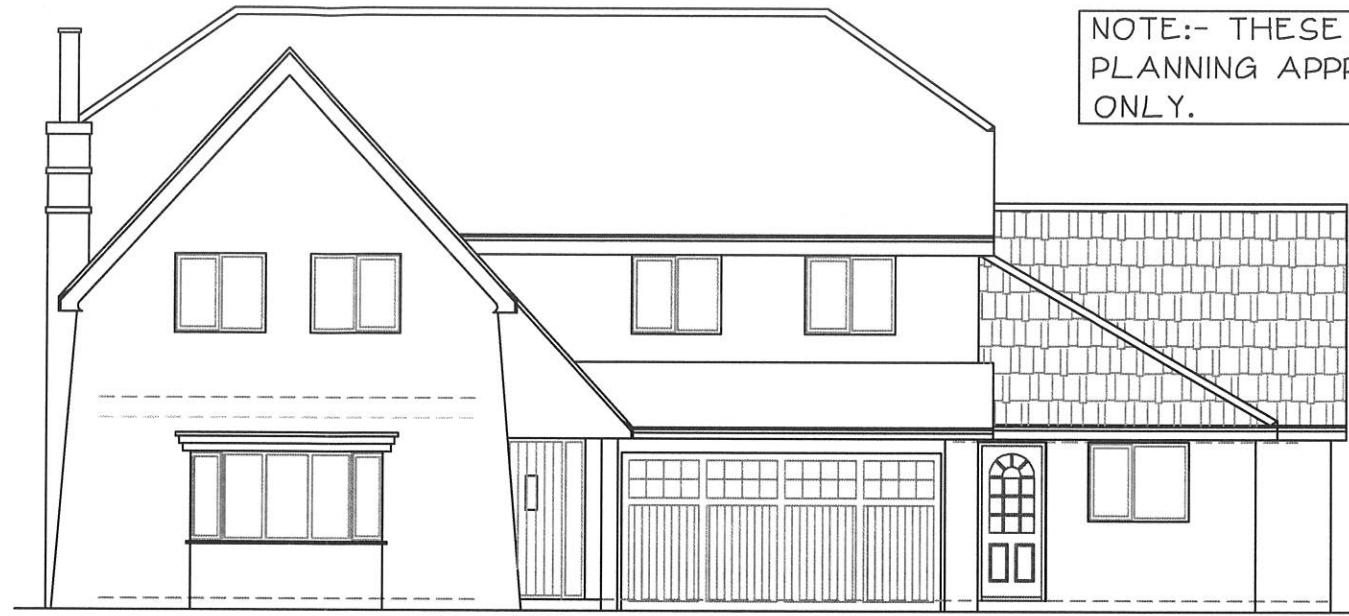
PROPOSED FRONT ELEVATION 'A'

NOTE:- THESE DRAWINGS ARE FOR PLANNING APPROVAL PURPOSES ONLY.